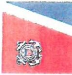
U.S. Coast Guard